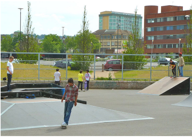
Fig. 7 Woolwich skatepark, London—this skatepark southeast London caters to a specific and largely youthful audience who appropriated an otherwise underutilised public space on the edge of the town and encouraged the local authority to invest in it as a dedicated space to meet their needs

this implies about how public they are is more important than who owns and manages them (Carmona et al. 2008, p. 80). In fact, public spaces are owned and managed through multiple complex arrangements, and always have been, and many are neither clearly public or private as regards who owns and manages them (Fig. 8). Moreover, restrictions on use apply to all spaces, regardless of ownership, not least as a means to ensure that their amenity value is distributed fairly across the range of potential users (Nemeth 2012, p. 21). Yet underpinning the notion of ‘public’ space in much of the literature is the idea that, as far as possible, space should be ‘free’, in three senses of the word: open, unrestricted and gratis. Arguably, whatever the