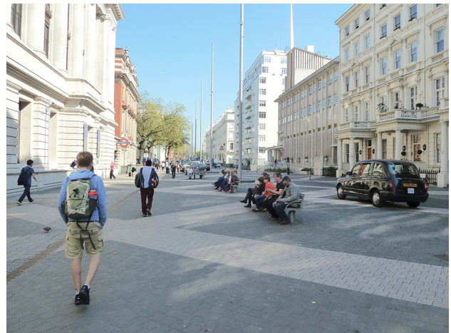
Fig. 4 Exhibition Road, London—here the local authority, the Royal Borough of Kensington and Chelsea, adopted shared space ideas to re-balance the priority given to pedestrians, overlaying the well established street function with a distinct new linear public space function