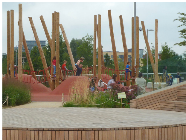
Fig. 6 Queen Elisabeth Olympic Park, London—the new spaces of Queen Elisabeth Olympic Park are varied in themselves but range from raucous play spaces to quiet areas for peaceful relaxation

in the right locations although not necessarily everything for all everywhere. It is important for planners to recognise this legitimate diversity, particularly in large cities, and to avoid imposing one-size-fits-all aspirations on public space projects that play into critiques around the homogenisation of public space (e.g. Light and Smith 1998; Sennett 1990). In this respect, the public spaces of a town or city can be planned in a strategic sense just as the buildings are, with care taken to ensure that all sections of the community are catered for, and that spaces are provided in locations that are safe, convenient and inviting to use and that avoid conflict, for example, between skateboarders and commercial interests or between revellers and residents.