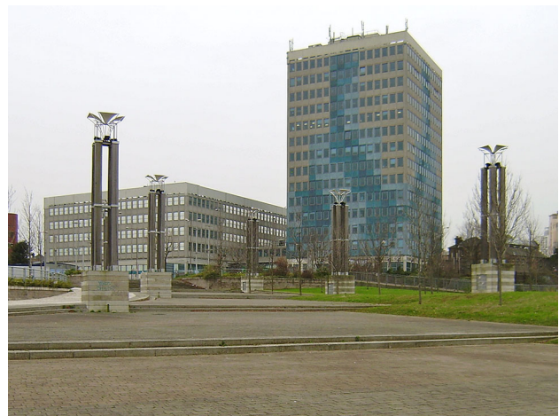
Fig. 13 Royal Arsenal Gardens, London—this new square on the edge of Woolwich in south east London was created at great expense to connect the town to the River Thames, but remained a largely deserted and often foreboding space when the proposed developments around it failed to materialise leaving the space without a purpose

Despite criticisms that public spaces have become over-commercialised and unduly dominated by the pressure to consume (e.g. Hajer and Reijndorp 2001), much of the buzz associated with particularly active spaces will tend to be wrapped up in the activities of consumption of one sort or another—shops, cafes, bars, markets, etc.—and typically these processes animate and enrich public spaces and are welcomed by users (Fig. 14). If the intention is to create such a space then active uses should be carefully designed into the public space from the start, helping to fill them