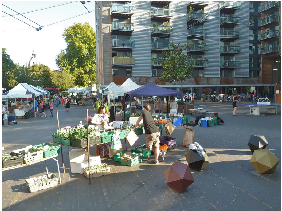
Fig. 14 Bermondsey Square, London—this new square in a very diverse part of south London houses a farmers market, an antiques market, and an array of informal activities (including table tennis). Opening onto it is a supermarket, a hotel, a café, a number of small shops and a large number of apartments

with life and allowing users to engage with them. The importance of getting the use mix surrounding (and within) public spaces right is therefore an early and critical lesson in the public space design process and involves decisions in which planners almost always play a leading role.