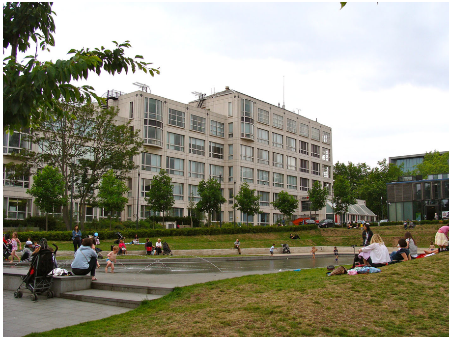
Fig. 23 Swiss Cottage Community Square, London—this large new space is highly popular and adaptable, allowing for relaxation and play throughout the day by a range of user groups