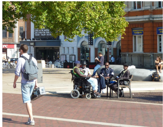
Fig. 20 Windrush Square, London—this new incidental space reclaims part of the road carriageway to establish an important new hub for the multi-cultural social life of Brixton

maintained generally feeling safer than those that are not. Finally, spaces should be relaxing, with opportunities to stop and linger, for example, with good quality, comfortable and preferably moveable formal seating, informal seating opportunities (on steps, kerbs and walls), toilet facilities, soft landscaping and careful consideration given to microclimate (places to sit in the sun, and to shelter from the wind and the rain). Grass, for example, whilst requiring active maintenance, is very popular because it is