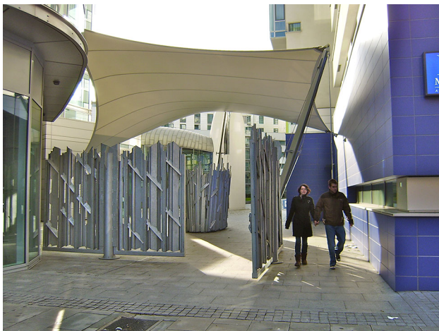
Fig. 12 Empire Square, London—a new public square was required by the planners in the middle of a residential block, but gated on the advice of the Metropolitan Police so that it could be closed at night in order to minimise resident/user conflicts. This has resulted in poor visual permeability and a less than clear status

and private realms of the city, recognising that public spaces in the wrong places can be more problematic than the absence of public space altogether (Fig. 12). Instead, public spaces (including all varieties of pseudo-public space) should be designed to appear welcoming, inviting and visually and physically accessible, avoiding any doubt in users' minds that they are clearly public, regardless of who owns and manages them. Equally, private spaces for relaxation such as private or communal gardens have an important and quite distinct role that is separate from the