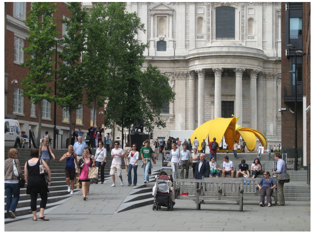
Fig. 17 Peter's Hill, London—here the dominant movement corridor through the space is very strong from St Pauls Cathedral to the River Thames, but space is provided in quieter areas for those who wish to stop and relax

The challenge of traffic dominance is a perennial problem that continues to blight many public spaces with severe knock-on impacts on their social life (Gehl and Gemzoe