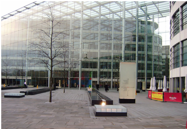
Fig. 11 Tower Place, London—here a new public space extends from between the two new buildings of the development and out into an open area alongside All Hallows-by-the-Tower Church. The presence of a glazed roof over part of this space, the obvious corporate nature of the buildings and the heavy presence of security guards undermines the sense of this being a public space and as a result it is not clear whether the general public are allowed into the space or not

and private realms of the city, recognising that public spaces in the wrong places can be more problematic than the absence of public space altogether (Fig. 12). Instead, public spaces (including all varieties of pseudo-public space) should be designed to appear welcoming, inviting and visually and physically accessible, avoiding any doubt in users' minds that they are clearly public, regardless of who owns and manages them. Equally, private spaces for relaxation such as private or communal gardens have an important and quite distinct role that is separate from the