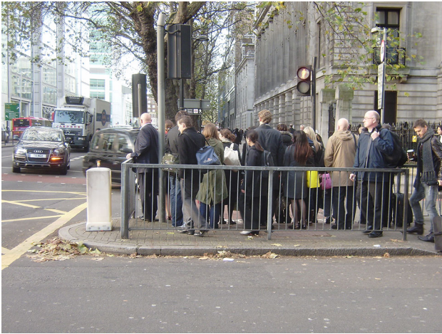
Fig. 19 Euston Road, London—barriers corraling the pedestrians are still a common site across London, although are gradually being removed (as they have been here) in favour of allowing pedestrians to make their own decisions about where, how and when to move

buildings of the historic Goods Yard where steam jets, fountains and lighting effects help animate the space