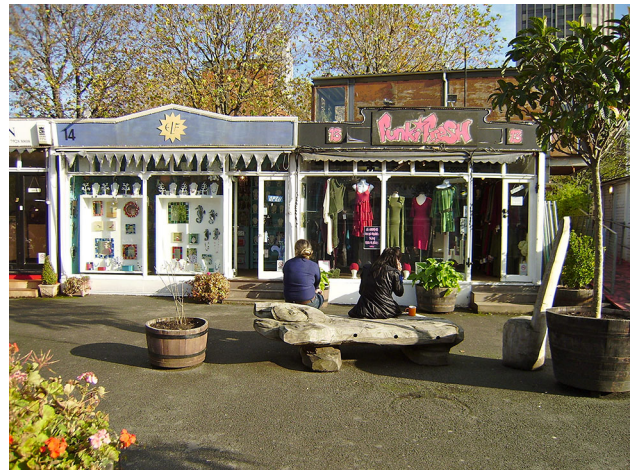
Fig. 3 Gabriel's Wharf, London—was created as a temporary space in 1988, and almost 30 years later is still a favoured meeting and activity place despite its somewhat (and increasingly) shabby appearance