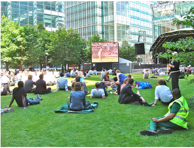
Fig. 16 Canada Square, London—is heavily used throughout the year for large-scale events and for everyday relaxation and social engagement. A big screen is a popular lunch time and after work entertainment for the workers of Canary Wharf

observational work revealed that movement in public space predominantly flows along dominant movement corridors or ‘desire lines’ passing right through spaces, and from movement corridors to the active uses on a space and vice versa. In the majority of spaces that are well integrated into the movement network, only a small proportion of users will actually stop within and engage directly with the space itself whilst the majority will pass straight through. Nevertheless, high levels of through movement will generally stimulate high levels of activity on the space, with the highest density of such activities (and social encounters) typically occurring in the gaps between the dominant lines of movement and being drawn to and around key amenities and features (Fig. 17).