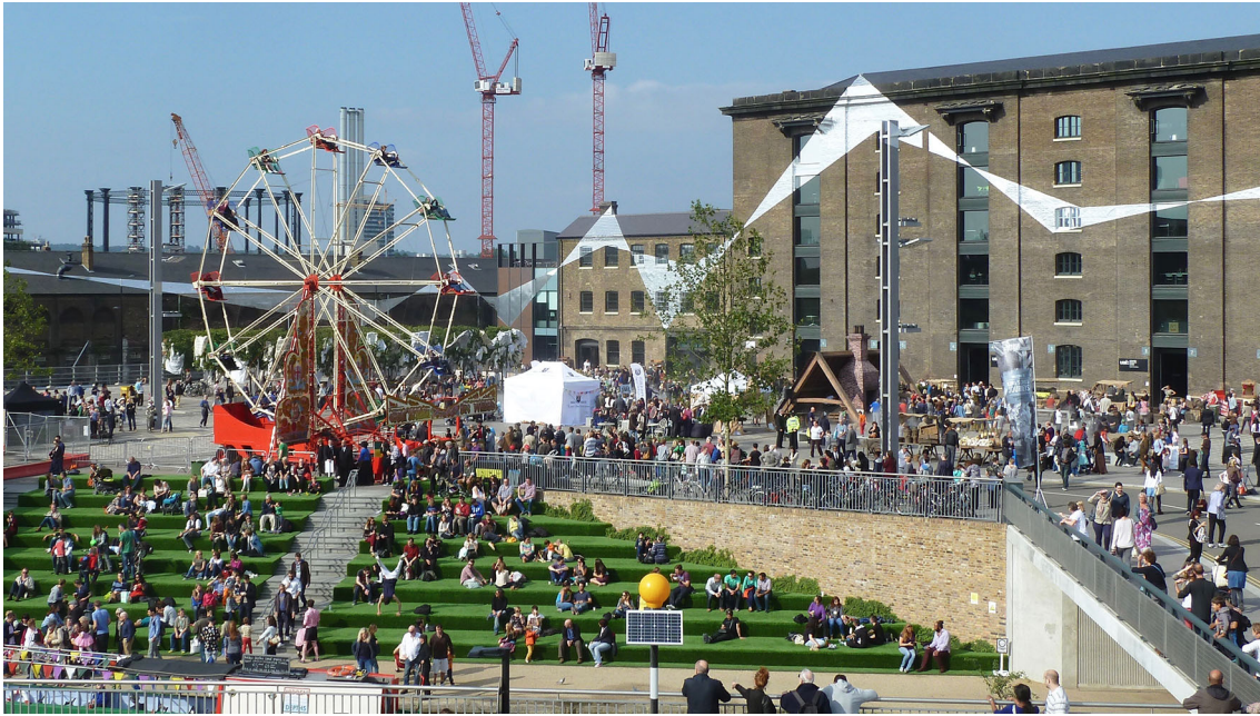
Fig. 18 Granary Square, London—the public space at the heart of the Kings Cross Railway Lands redevelopment incorporates a range of new subspaces, including onto the Regent’s Canal and setting off the

buildings of the historic Goods Yard where steam jets, fountains and lighting effects help animate the space