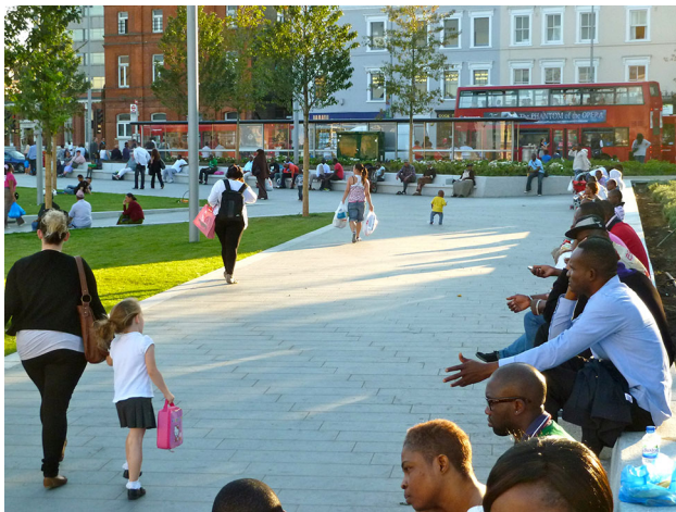
Fig. 22 General Gordon Square, London—the complete redesign of this space has transformed it from a sad and largely abandoned space into an active hub of life for the ethnically and economically diverse communities that live in Woolwich. In the summer it fills with people who sit, lounge and play on and around the grass and (sometimes) watch the big screen

uncluttered and with resilient natural materials, trees and planting), and background level of activity, are able to adapt and change over time in a manner that can withstand