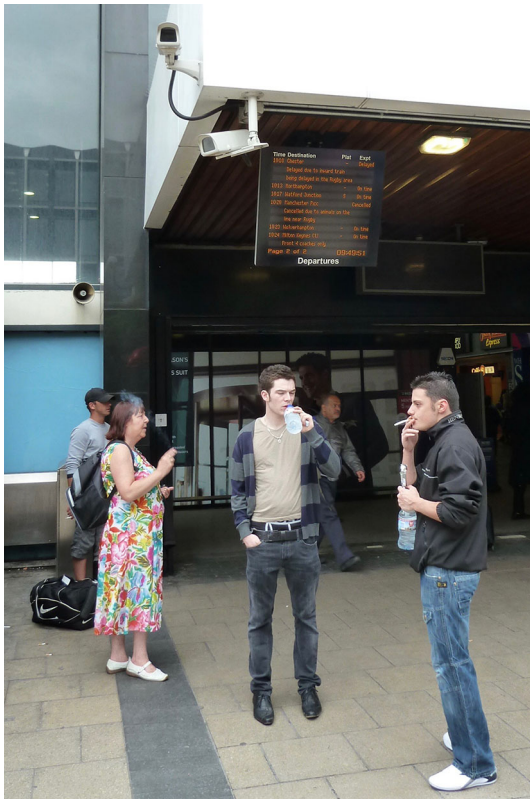
Fig. 21 Euston Station Piazza, London: smokers outside Euston station being watched over by prominent CCTV and often by a heavy police presence