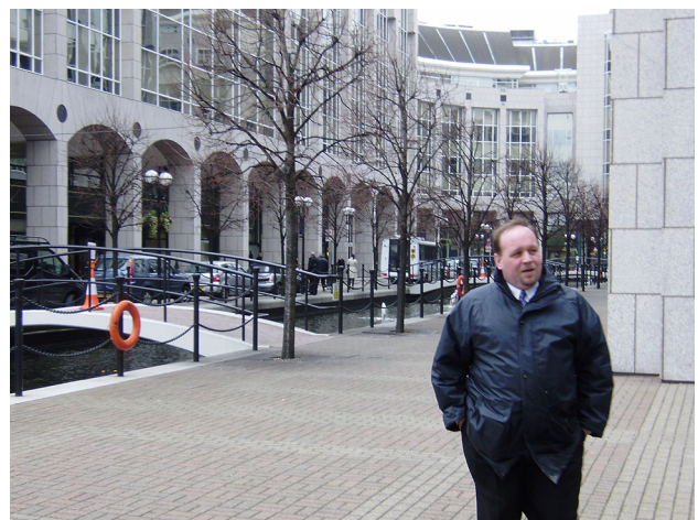
Fig. 9 Mulberry Place, London—the author being asked by private security to desist from taking photographs outside the Town Hall of the London Borough of Tower Hamlets, part of a private estate in Blackwall

Beyond strategic considerations relating to how public spaces evolve and are regulated, the balance of space types across an urban area, and how to guarantee rights and responsibilities; at a more detailed level, planners are also often the guardians of how new public spaces are created and existing spaces are regenerated. Thus through their plans, ordinances, frameworks and policies, or through