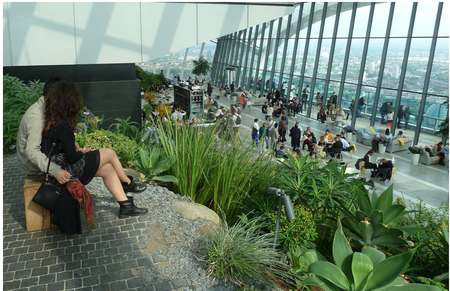
Fig. 1 Sky Garden, London—a new private ‘public space’ on top of the Walkie Talkie tower negotiated as part of the planning permission. Free to enter, but you need to book in advance, obtain a ticket and pass through security

case studies reflecting the diversity of space types encountered. The case studies involved the gathering of 70 stakeholder narratives (with those who had been involved in their creation and or on-going management), 650 interviews with public space users across the spaces, time-lapse observations to record how each space was used, morphological analysis and the collection of secondary data from the local press and from relevant policy documents.