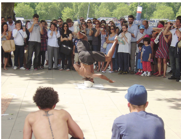
Fig. 5 Southbank, London—the sequence of spaces along the south bank of the Thames in central London have been transformed in recent years and now host a variety of ‘fun’ activities from public art, to performance, to consumption

This diversity recognises the diversity of lifestyles, preferences and needs amongst urban populations and that through the design of their public realm there is the opportunity for urban areas to offer something for everyone