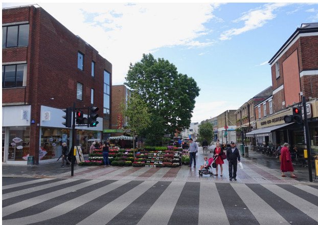
Fig. 2 Passey Place, London—here the end of a side street onto Eltham's busy High Street has been paved over to create an incidental space for shoppers to rest and for informal activities to be hosted

All these sorts of processes will involve distinct planning inputs although they may be initiated outside of the formal planning processes, and most notably from within the highways/street management function of municipalities (Fig. 4). In all cases, planners will need to be flexible enough to understand and embrace the evolving nature of public space, and mindful of the important role of the range of public sector agencies that impact on the shaping of public spaces. In London, for example, four forms of regulation have been critical when creating or re-shaping public spaces: