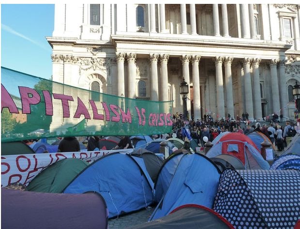
Fig. 8 St Paul's Churchyard, London—spaces surrounding St Paul's Cathedral are in a range of ownerships, including this one, site of the 2012 Occupy encampment, which is owned by the Church of England, although managed by the City of London and is an open and fully accessible part of the local street network

this implies about how public they are is more important than who owns and manages them (Carmona et al. 2008, p. 80). In fact, public spaces are owned and managed through multiple complex arrangements, and always have been, and many are neither clearly public or private as regards who owns and manages them (Fig. 8). Moreover, restrictions on use apply to all spaces, regardless of ownership, not least as a means to ensure that their amenity value is distributed fairly across the range of potential users (Nemeth 2012, p. 21). Yet underpinning the notion of ‘public’ space in much of the literature is the idea that, as far as possible, space should be ‘free’, in three senses of the word: open, unrestricted and gratis. Arguably, whatever the